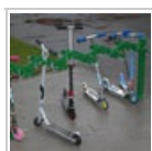
Scooter parking spaces 82 spaces