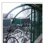
Helmet lockers 0 lockers