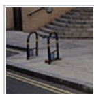
Sheffield stand 0 cycle parking spaces