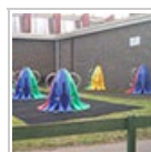
Other cycling parking spaces 0 spaces