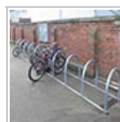
Cycle racks 4 cycle parking spaces