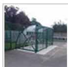
Covered sheffield stand 10 cycle parking spaces